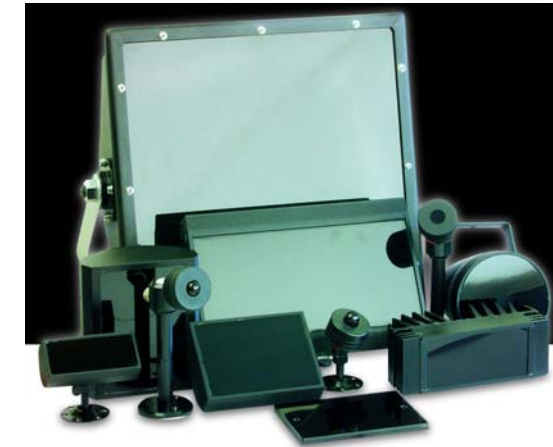
INFRARED ILLUMINATOR IR-16